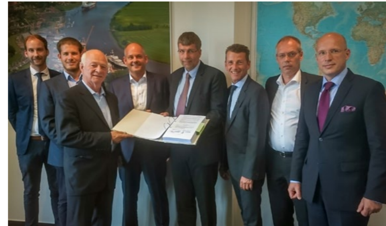
Ceremonial signature of the restoration contract to the Peters Werft (1)

preserves Hamburg's maritime history) and putting the work out to tender. The shortlist of applicants included Blohm + Voss, Emden Werft und Dock GmbH, Peters Werft from Wewelseth on the river Stör, as well as the consortium Elsether Werft/Bremerhavener Dockgesellschaft. The PEKING, built in 1911 by Blohm +