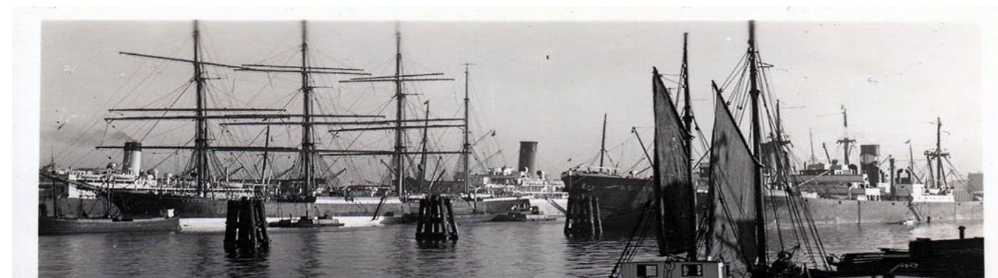
PEKING in the Hansa port, Hamburg, end of the 1920s