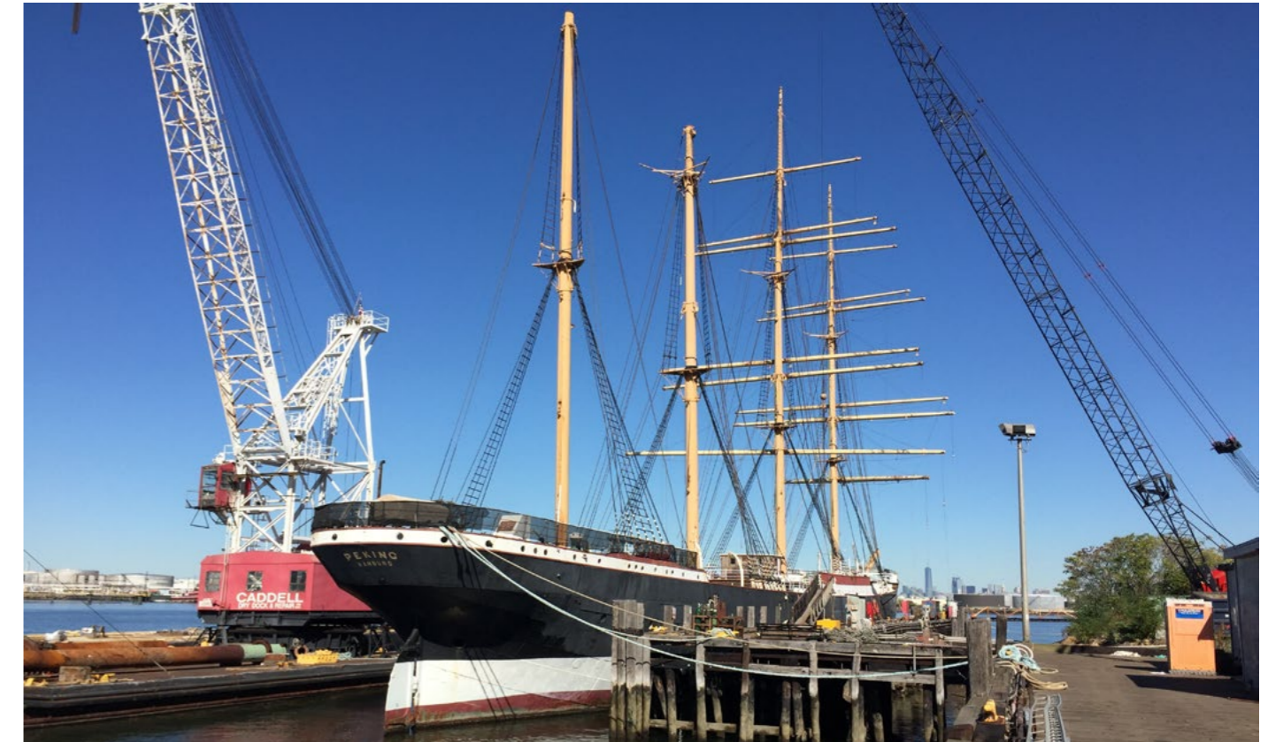
PEKING during transport preparation at the Caddel shipyard, New York

ARETHUSA in Medway on the east coast of England, serving as a floating college, before being sold and moved to New York in 1975. This is where she has been moored for many years, before being put up for sale. Now she is returning to her home port of Hamburg.